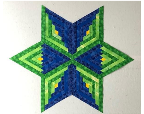
North/South & East/West