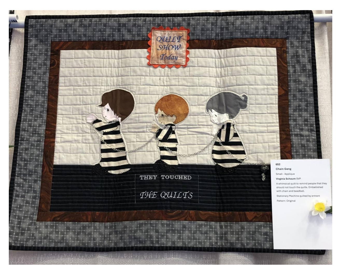
Has this Happened to You? Entry from the Empire Quilt Fest